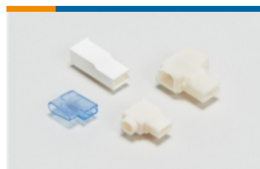
Crimp Terminal Housings(17)